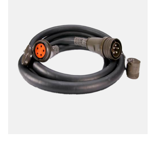
Contact: Amphenol PCD amphenolpcd.com