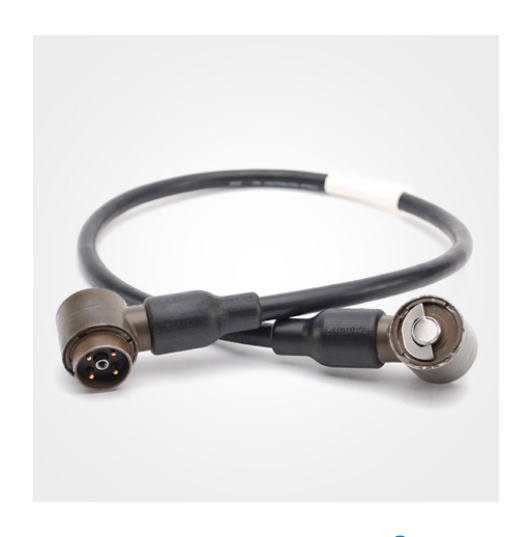
Contact: Amphenol PCD amphenolpcd.com