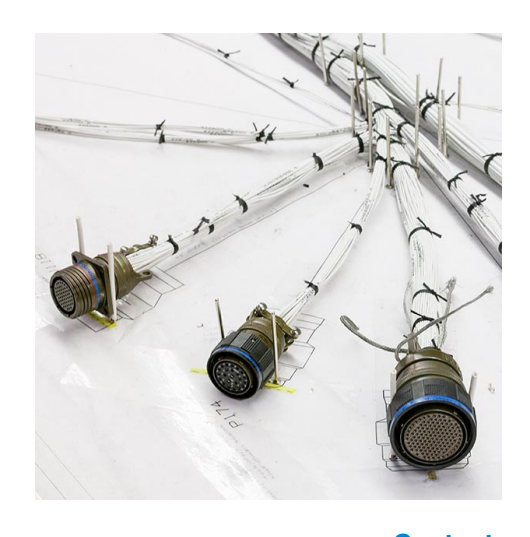
Amphenol Borisch Technologies borisch.com