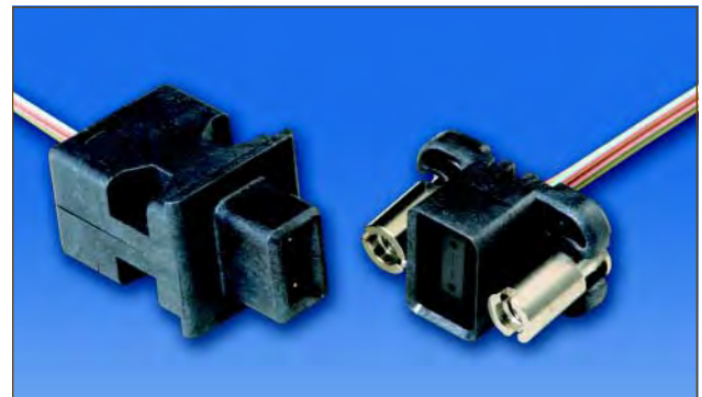
VME P0/J0 MT Connectors

Amphenol's VME P0/J0 fiber optic connectors are used in military and commercial aviation, military vehicles and GPS systems. They are designed to customer specifications. Consult Amphenol Aerospace for further information.