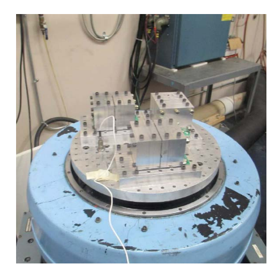
Figure 2: Mechanical Shock test set-up